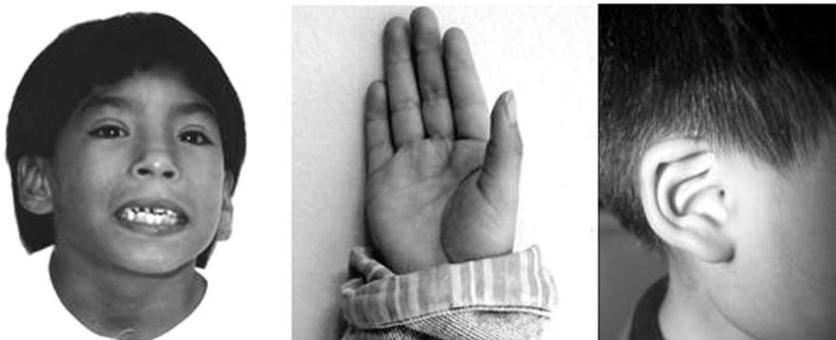
Fig 1. Left, Child with FAS. Short palpebral fissures, a smooth philtrum, and a thin upper lip are evident. Center, “Hockey stick” configuration of the upper palmar crease, a minor anomaly common among children with FAS. Right, “Railroad track” ear.

Because the term FAE had gained acceptance by health care agencies, tremendous pressure on clinicians to make this diagnosis often was exerted by